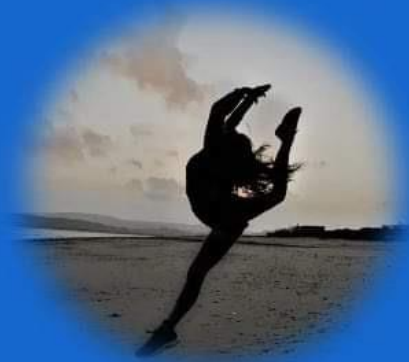
SCSD Dancer

Ballet, Tap & Disco/Street Dance Classes for children & Teenagers (Pre-school Ballet from age 2)